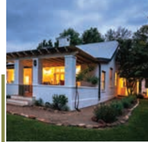
WILD OLIVE HOUSE