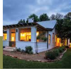
WILD OLIVE HOUSE