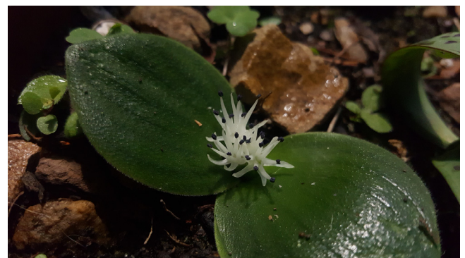
Fig. 2. Massonia elandsmontana , flowering plant. Voucher: Western Cape, Elandsberg Nature Reserve, Manning 3584.

Diagnosis : the species is distinctive in the genus in its pubescent foliage, the otherwise smooth adaxial surface covered with short, erect hairs 0.5–1.0 mm long and the margins densely ciliate with shorter bristles, with a few-flowered inflorescence of small, white, hypocrateriform flowers with slender perianth tube 7–8 mm long.